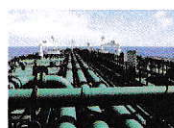
Marine Grade Pipe