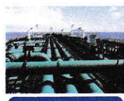
Marine Grade Pipe