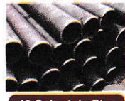
40 Schedule Pipe