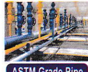
ASTM Grade Pipe