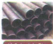
40 Schedule Pipe