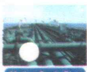
Marine Grade Pipe