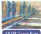
ASTM Grade Pipe