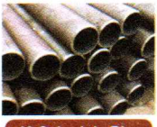
40 Schedule Pipe