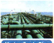
Marine Grade Pipe