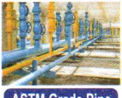
ASTM Grade Pipe