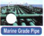
Marine Grade Pipe