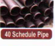
40 Schedule Pipe