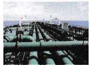
Marine Grade Pipe