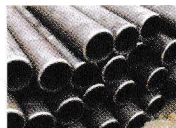
40 Schedule Pipe