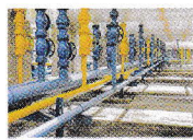
ASTM Grade Pipe