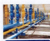
ASTM Grade Pipe