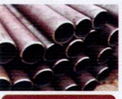
40 Schedule Pipe