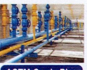
ASTM Grade Pipe