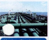
Marine Grade Pipe