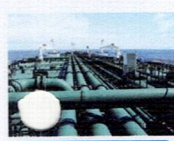
Marine Grade Pipe