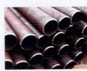
40 Schedule Pipe