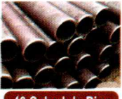
40 Schedule Pipe