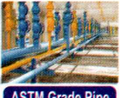
ASTM Grade Pipe