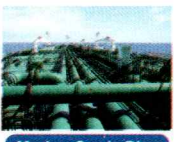
Marine Grade Pipe