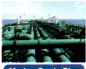
Marine Grade Pipe