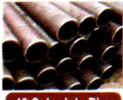
40 Schedule Pipe